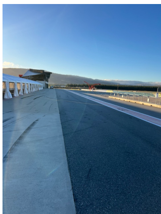
Diagram below – Vehicles are only permitted to stop in the Working Lane (concrete area in the picture below) from the Fast Lane (to the right of the double white lines in the below picture) vehicles may only cross the Merge Lane for the minimum distance required to safely enter or exit their Pit Bay.