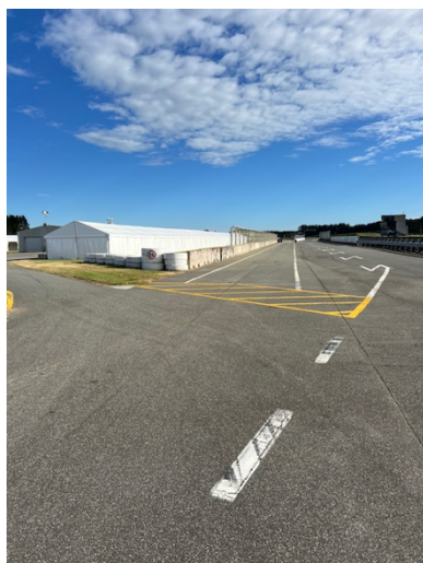
Diagram below – Vehicles are only permitted to stop in the Working Lane between the 2 solid White Line in the picture below, from the Fast Lane vehicles may only cross the Merge Lane for the minimum distance required to safely enter or exit their Pit Bay.