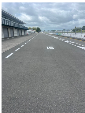
Diagram below – Vehicles are only permitted to stop in the Working Lane (to the left of the broken white lines in the picture below) from the Fast Lane ( to the right of the double white lines in the below picture) vehicles may only cross the Merge Lane for the minimum distance required to safely enter or exit their Pit Bay.